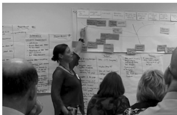
Fig. 3. A participant using the emotional map to describe a patient story.

The persistence of the emotion map supported the design activities in a number of ways. Both lay participants and health professionals used it while presenting their stories, each person pointing to different parts of the map as shown in Fig. 3. When groups began to prioritise issues, the participants could remind themselves and each other of the important themes. One health professional said in response to a public participant raising an issue, "oh yes, there were lots of them [post-it notes] for that, weren't there." When the language of discussion turned to clinical themes, the facilitators used the map to re-focus the