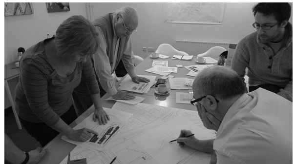
Fig. 2. People working around "A Road" map.

The emotional maps provided a temporal collation of the patients' and health professionals' experiences and concerns that could be shared with the alternate group. In the session in which public participants and health professionals first came together, representatives from each group used the map to explain their perspectives, tell stories and summarise their concerns for discussion.